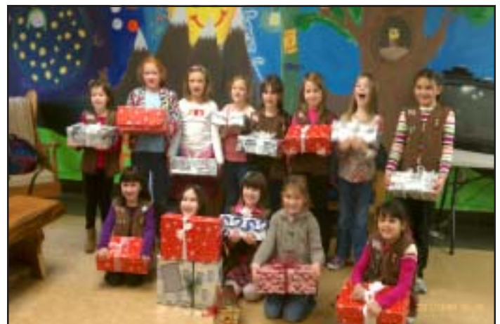
Brownie Troop 11321 helped out the Nottingham Food Pantry this holiday season. They wrapped and filled boxes with stocking stuffers for 17 families in need.