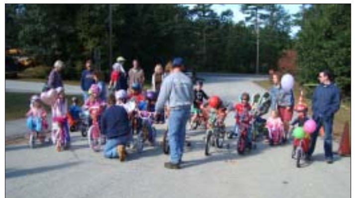
The kids bike parade at Nottingham Day