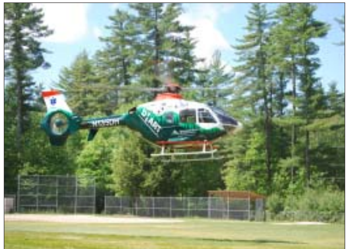
Dartmouth Hitchcock Advanced Response Team Helicopter

Call 911 in any emergency. Call the Fire Station during business hours for other assistance or questions at 679-5666.