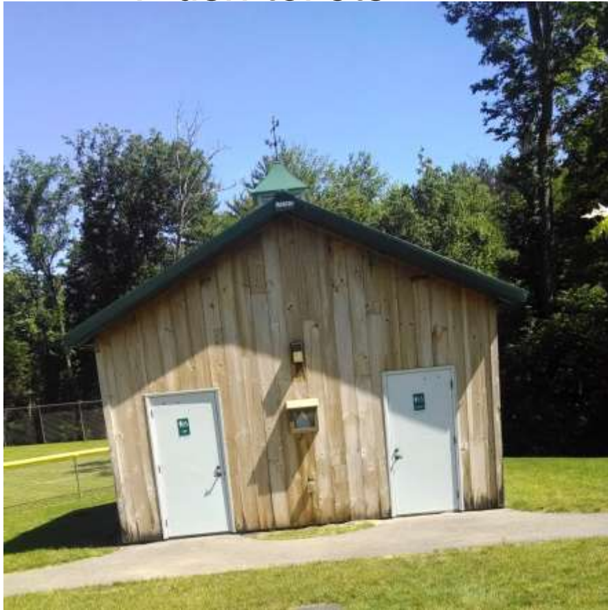
Separate Building for bathrooms