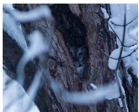
great horned owl in tree cavity

Healthy trees are aesthetically pleasing to people and help serve the needs of nature, but when trees have lost limbs, become hollow, or died, that does not mean they do not support life. On the contrary, trees with cavities and other scars are often even more important for wildlife. As trees suffer lost limbs, lightning strikes, or attack by insects, decay sets in and pockets form. Over time, these cavities provide essential shelter to a wide variety of animals, from tiny wrens to wood ducks and even black bears. The greater the variety of cavity sizes in an area, the greater the chances are that a variety of wildlife will use them.