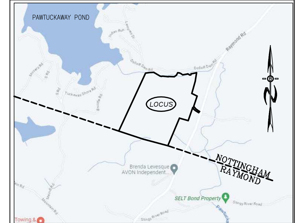
LOCATION MAP 1"=1000'

70 PORTSMOUTH AVE. THIRD FLOOR, SUITE 2 STRATHAM, N.H. 03885 PHONE: 603-583-4860, FAX: 603-583-4863