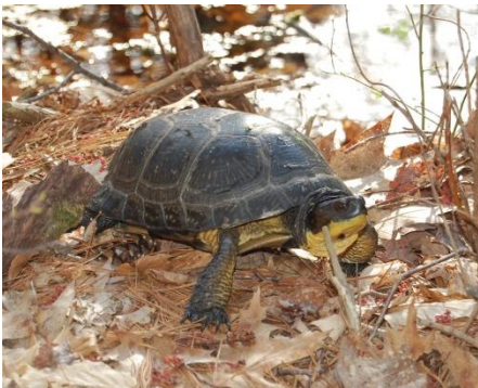
Blanding's turtle

Blanding's turtles are listed as endangered in New Hampshire. They have large ranges and require diverse habitats to meet their physiological and reproductive needs. Because they need to travel, they are at an increased risk for encounters with vehicles and predators. Females produce only a dozen or so eggs each year and they do not reach sexual maturity until 15 to 20 years of age. Like most turtles, they lay eggs in sandy or gravelly soils, but Blanding's turtles often select dangerous sites such as sandy road shoulders.