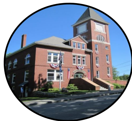
Epping Town Hall, made from Epping bricks